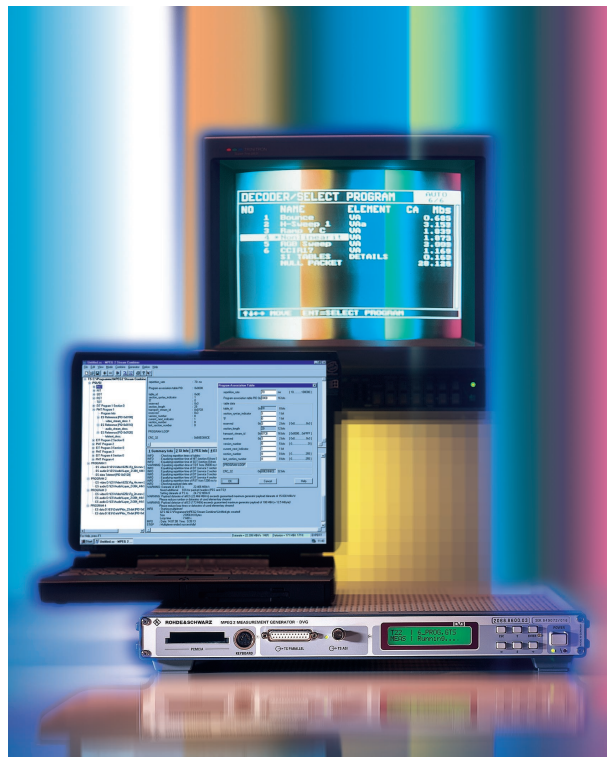
Application-specific transport stream generation with optional PC software Stream Combiner™ DVG-B1

Complementary to Generator DVG, Rohde&Schwarz offers MPEG2 Measurement Decoder DVMD (data sheet PD 757.2744), which is used for real-time monitoring, analyzing and decoding of MPEG2 transport streams.